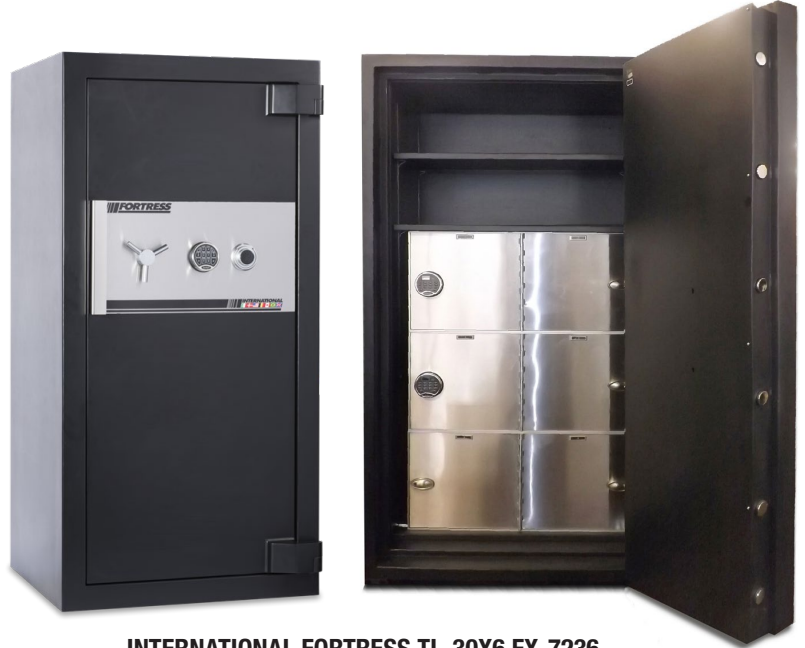
INTERNATIONAL FORTRESS TL-30X6 FX-7236